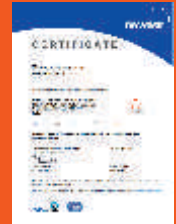
ISO 9001:2015 Certificate