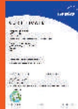
IATF 16949:2016 Certificate

PYROTHERM TECHNOLOGIES is an IATF 16949:2016 & ISO 9001:2015 certified company, an internationally recognized standard that ensures that our services meet the needs of our customers through an effective quality management system.